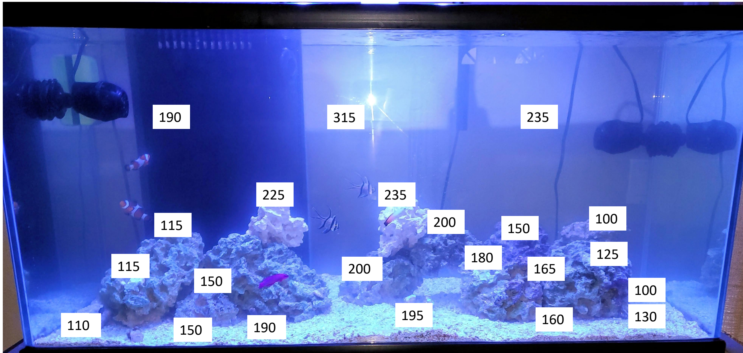
Blue 4, 100% intensity, clear water, light at 9" from glass