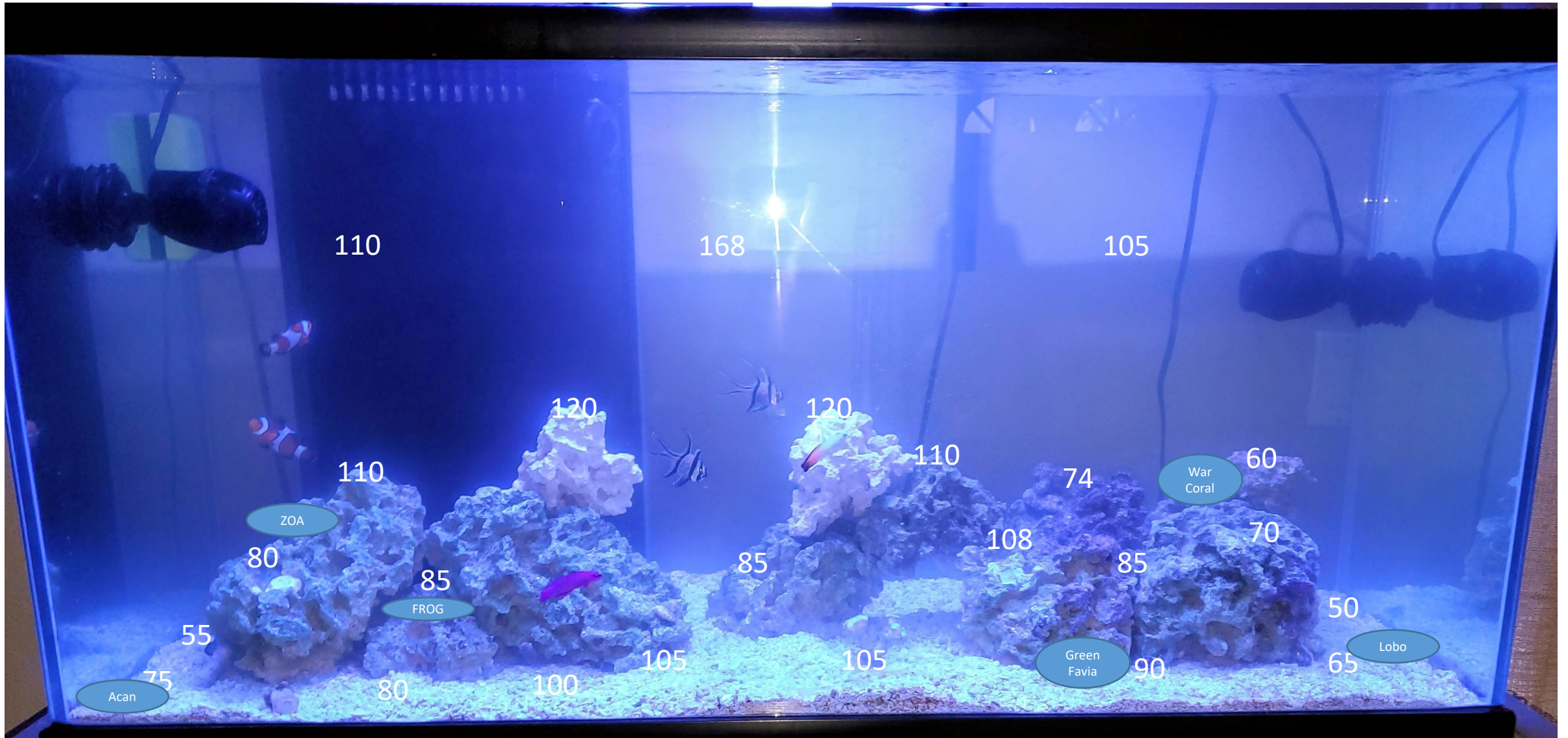
Blue 5, 50% intensity, clear water, light at 11.5" from glass